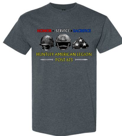
Back of shirt