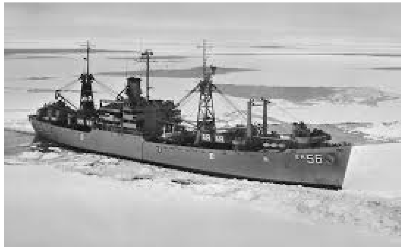
USS Arneb in Artic Waters